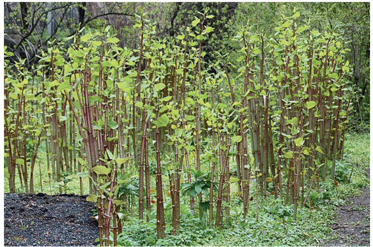
Japanese knotweed, emerging in the spring from its bamboo-like stem.

The Nipissing First Nation (NFN) Environment Department is excited to announce the receipt of a new grant aimed at tackling invasive species within our community, with a particular focus on Japanese knotweed. This project builds upon our previous successful efforts in eradicating phragmites and emphasizes the importance of strategic planning in managing invasive species.