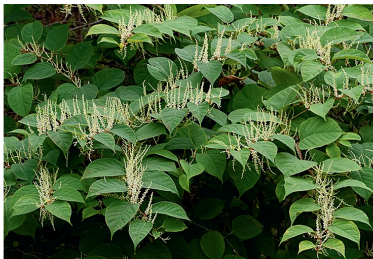
Japanese knotweed, flowering.

The NFN Environment Department is committed to protecting our community's natural resources and biodiversity. This new grant enables us to expand our efforts in managing invasive species, utilizing innovative technologies, and engaging our youth in environmental stewardship. Together, we can ensure a healthier and more sustainable environment for future generations.