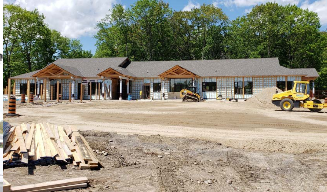
Duchesnay Daycare & Community Centre $4M