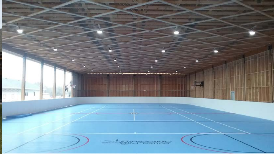
New Outdoor Covered Rink Garden Village $850K