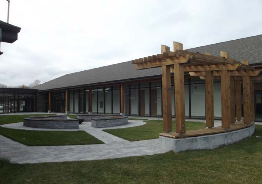
Expansion of Administration Offices Garden Village $3.6M