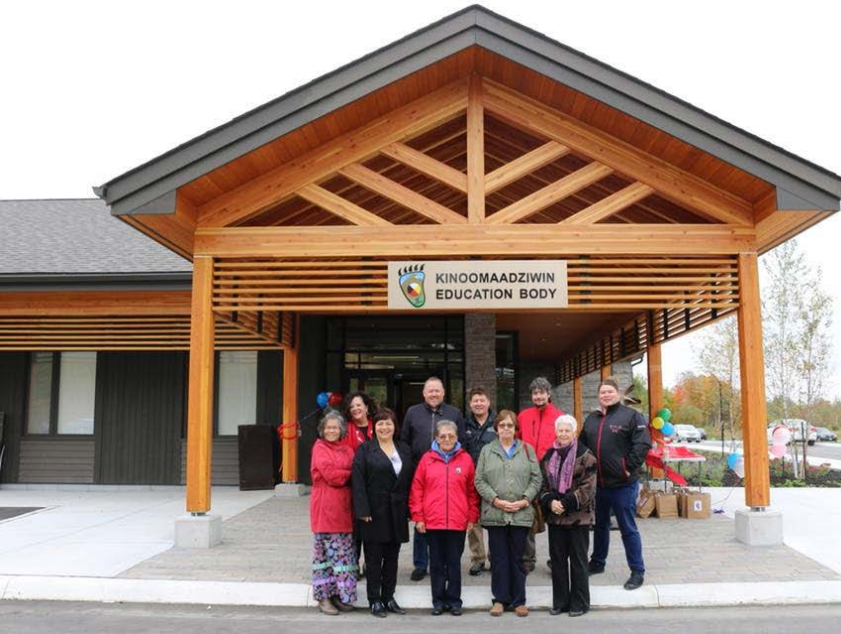
Small Business Centre Development Home of the Anishinabek Education System $3.1M