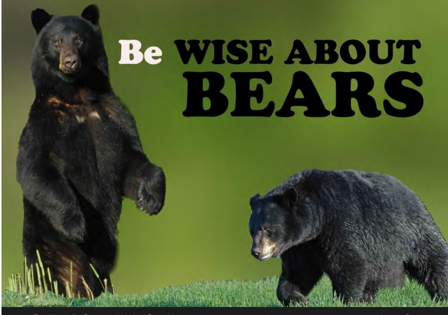
Call APS or 911 if a bear poses a threat to personal safety