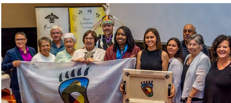
AES/MEA Signing on August 16, 2017