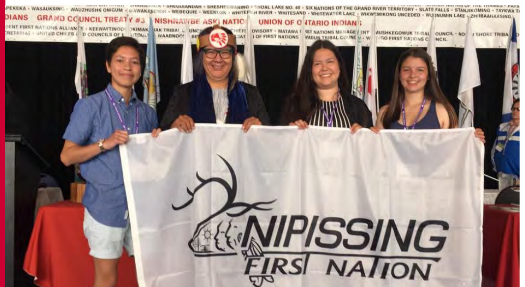
NFN Youth Leaders Present our Flag to New ORC RoseAnne Archibald

Given the theme of this year's conference— Securing a Future for Our Children: Advancing our Nations —it's only fitting that NFN youth played a huge role in the conference. The grand entry on Tuesday morning included local youth and students from Our Lady of Sorrows School, many of whom also assisted with counting votes in the traditional stand-up election and other tasks during the event.