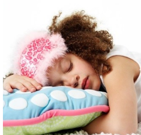
LACK OF ENERGY