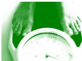
UNEXPLAINED WEIGHT LOSS