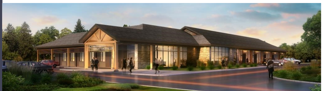
Rendering of Future KEB Building ~ Mitchell Jensen Architects

The KEB is not intended to direct First Nations, but rather will take direction from First Nations and provide advice and support. The First Nations that join the education system will work together through the KEB to identify and manage their educational priorities and the systems’ governance.